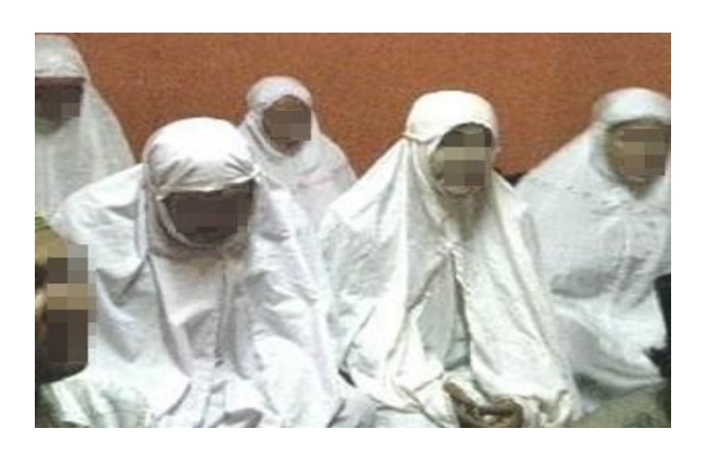
Figure 4. Transgender santris wearing mukena during salat

The factor uniting transgender and worship is reverted to fitrah (character) of transgender as mankind in general making religion the life guidance, and obligation of worship. They wear dress covering aurat for Muslimah (Muslim women) like gamis (robe) and veil. In worship, they also seek for their comfort. Those feeling comfortable with using mukena (prayer hijab), will wear it during worshipping, as well as those feeling comfortable with using koko shirt, sarong and peci (head covering for men).