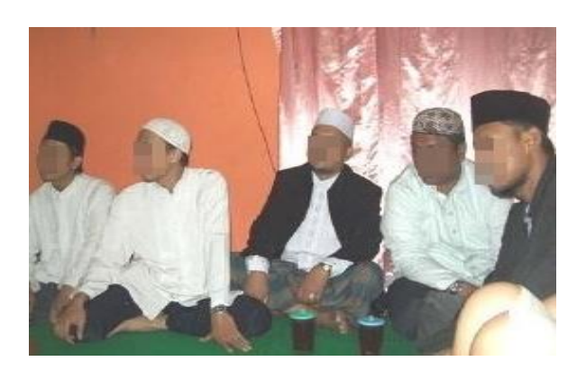
Figure 5. Transgender santris wearing koko shirt, sarong, and peci comfortably

Transgender attitude and behavior also change during attending Quran study. In Islamic Boarding School, they have a normal attitude just like santris interacting with their Ustaz , so the communication established is a formal one. Some of them hide their sexuality in their religious community because of their fear of stigmatization.