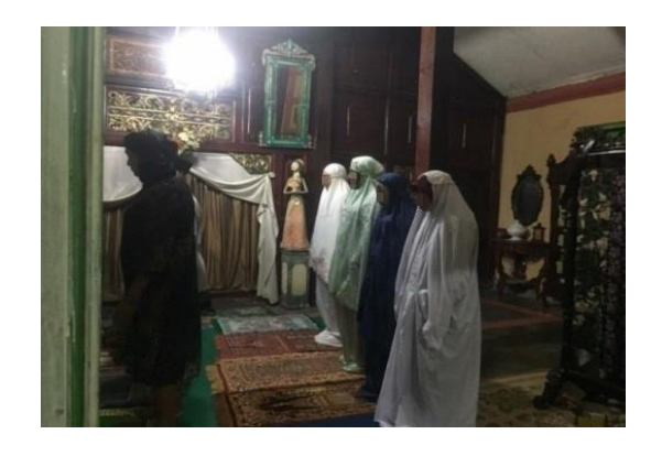
Figure 2. The back row in salat for feminine transgender