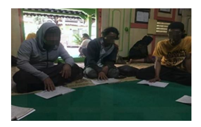
Figure 3. Study activities in the Month of Ramadan Source: Primary Data, 2019

Besides fasting and other related worship, transgender also does a series of social activities to help fellow transgender improve their quality of life, e.g. creating a family support group to help transgender not acceptable fully to their family, and providing training for corpse handling in collaboration with Indonesian Family Planning Association of Yogyakarta. This activity is held recalling two cases in which surrounding people declined to handle transgender corpses. Cooperatives Small and Medium Enterprises Office of Yogyakarta also provides training for business management and business mapping using the canvas model. Also, IWAYO provides training for make-up, hair bun making, hijab-wearing, and hairstyling skills. The skills are expected to give the sex workers other choices of the profession that more acceptable to society. Some college santris donate Iqra '(the book about guidance and guidelines in reading verses of the Quran), and books about guidance and guidelines for salat, and discuss and conduct Quran study along with transgender.