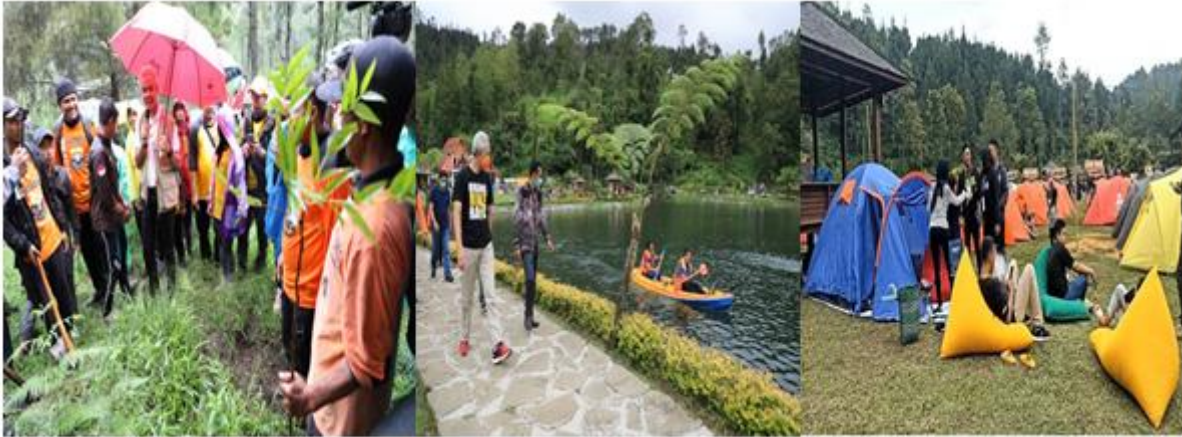
Figure 1. Governor of Central Java, Ganjar Pranowo, and residents planting trees for large-scale reforestation, followed by a visit to Telaga Madirda

slopes. Governor Pranowo's positive response to the special night camping event at Telaga Madirda further contributed to its prominence.