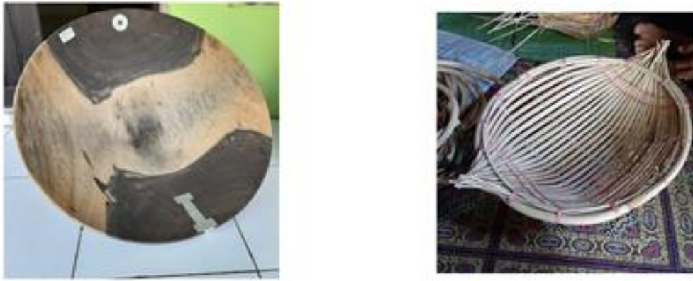
Figure 2. The traditional tool for diamond panning