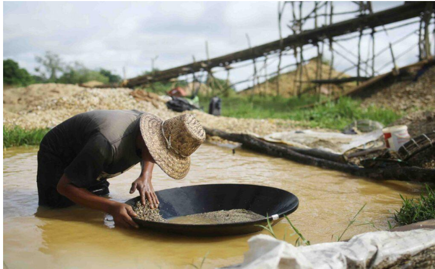
Figure 3. Diamond Panning Activities